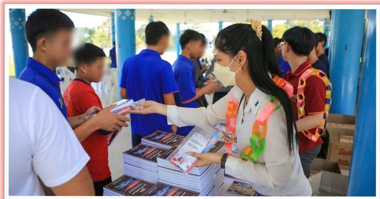
Notice how young they all are.