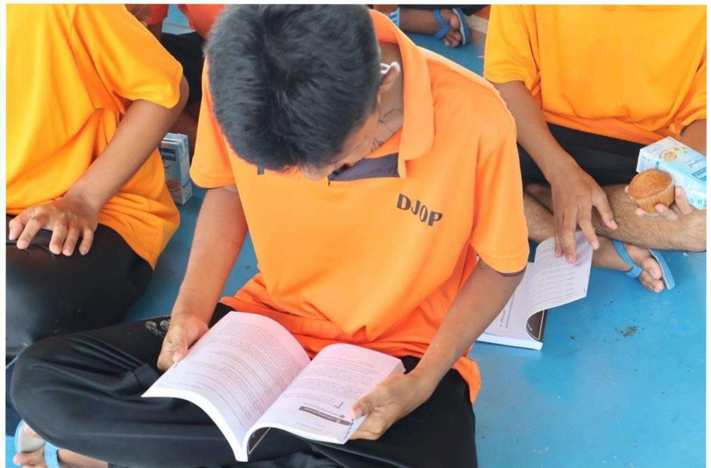
Each individual is offered the opportunity to read and study with a prison ministry team. Through situations like this, we can see how much God cares for people's souls, and desires that they all be saved.