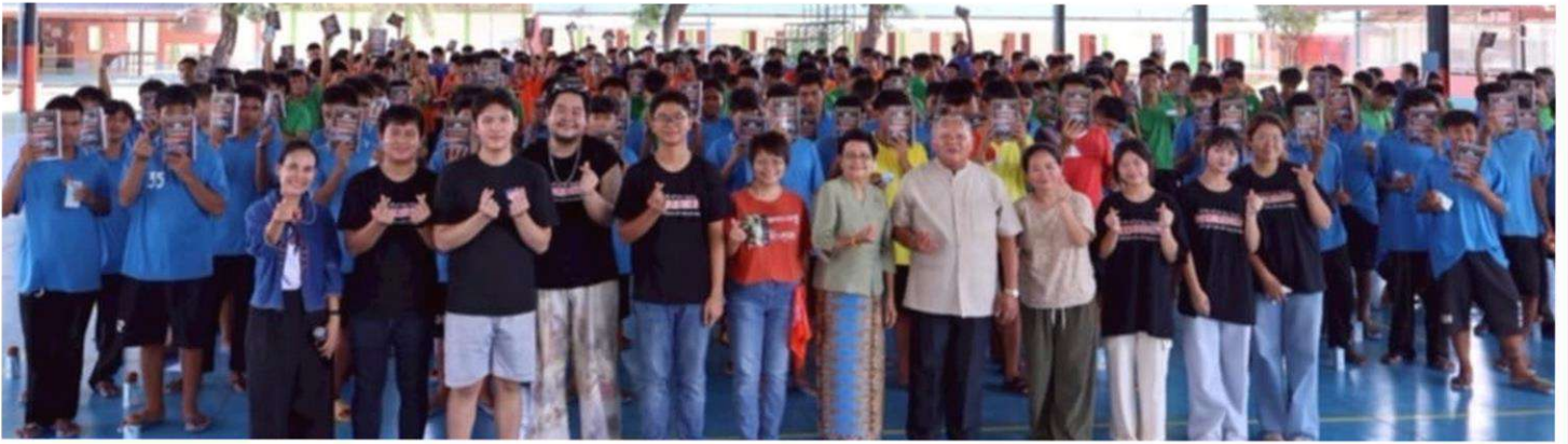
Prisoners are holding the books to cover their faces while the prison ministry team stands in the front row. Praise God that 380 teenagers at this detention center received the books.