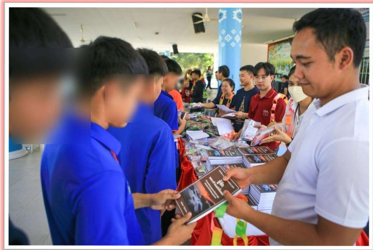
They are lining up to receive my book so that each person can own a copy.